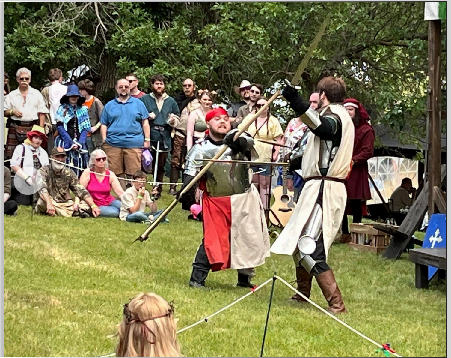
Knights have at it during the Black Hills Renaissance Festival . (Additional Photos on A5)

The Renaissance Festival ran last Friday Saturday and Sunday at Kickstands Campground 13014 Pleasant Valley Rd, Sturgis, SD .