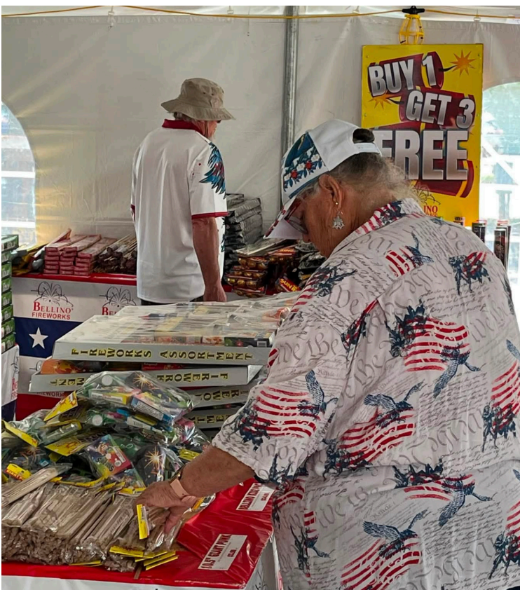
(Above) Someone is going to have a great 4th; (Below) 3. How long do you think it would take for 16,000 firecrackers to go off? Hmmm?!?!?